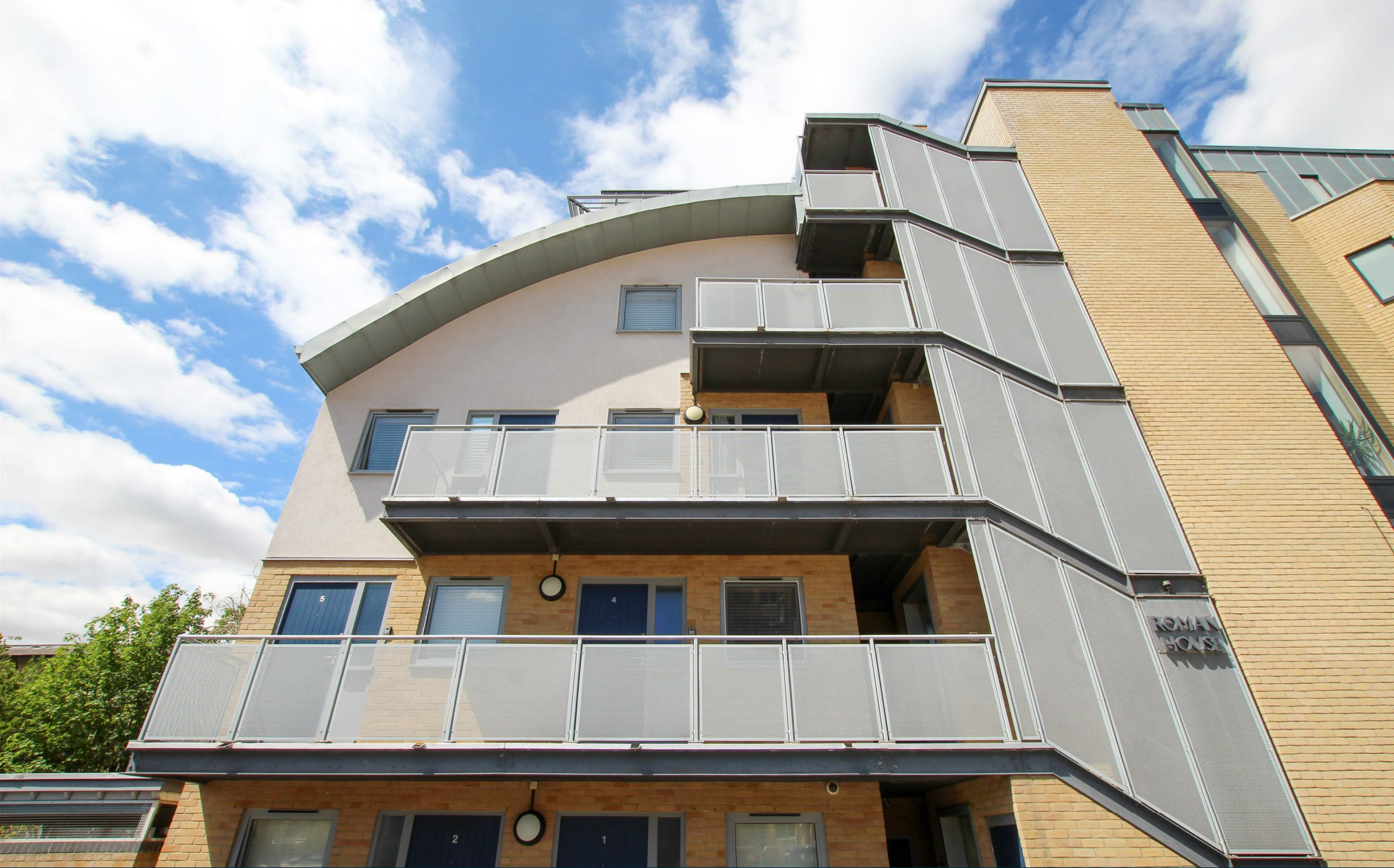
Roman House, Severn Place, Cambridge, CB1 1AL